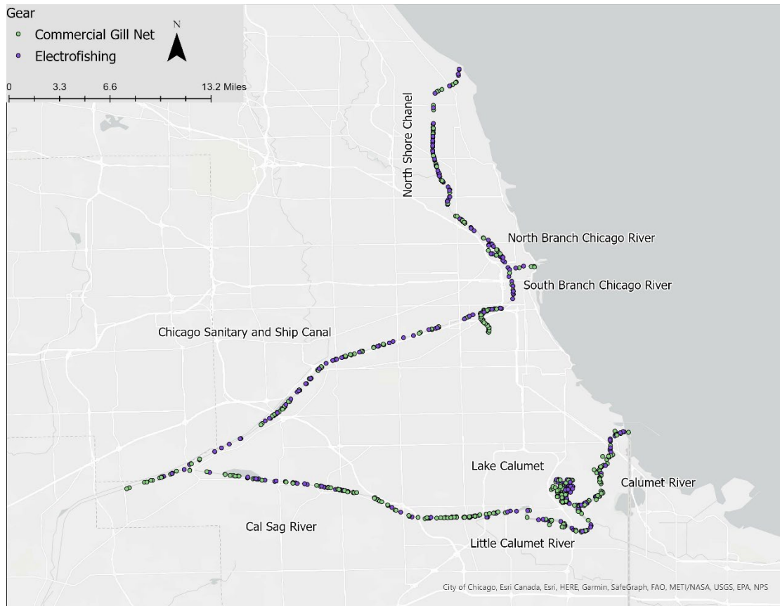
Figure 1. Sample locations throughout the Chicago Area Waterway during the Fall 2021 Seasonal Intensive Monitoring.