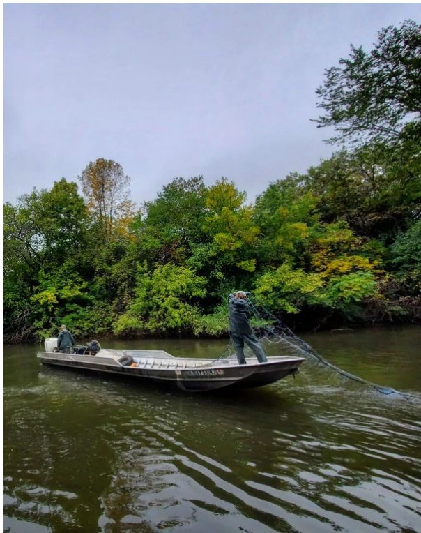
Figure 2. Contracted fisher setting a gill net during fall Seasonal Intensive Monitoring.