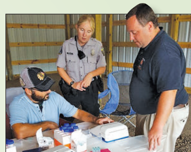
Law enforcement processing eDNA samples.

Scientists do risk assessments to estimate the likelihood a species may invade, spread, or cause economic or ecological damage; to identify ecosystems or habitats most likely to be invaded; and to estimate other risks associated with species’ invasions. Risk assessments are part of the IPM process and help managers focus monitoring and control efforts. The USGS has worked with the Government of Canada on a completed international bighead carp and silver carp risk assessment and is part of a partnership developing assessments for grass carp and black carp. The USGS also strives to inform and support decision-makers by producing easy-to-use decision tools based on risk-assessment results.