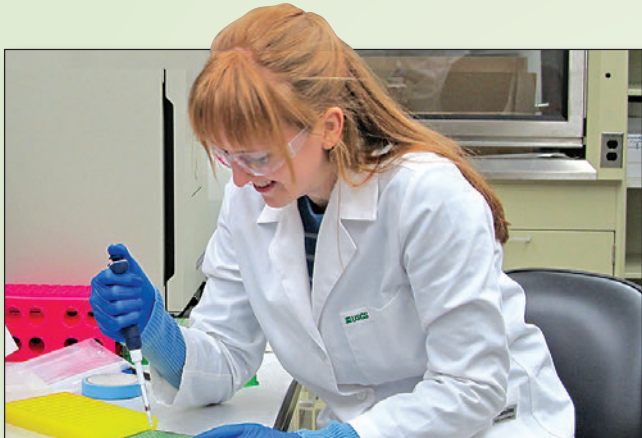
Samples containing environmental DNA are processed in a laboratory.

Early detection is a vital part of managing any invasive species. Detection of Asian carp is difficult because they avoid nets and other traditional capture gear, so they are hard to catch especially when populations are small. The USGS has contributed to the development and improvement of new genetic approaches to detect Asian carp at low abundances and identify initial invasions.