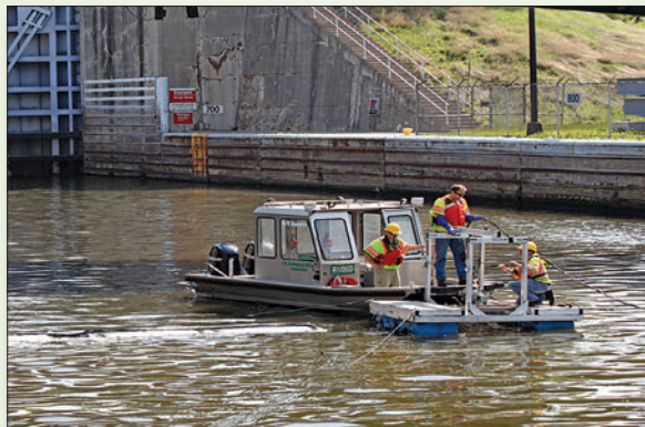
USGS scientists measuring flow velocity in a lock channel.

The USGS is testing the use of underwater sounds to deter further spread of Asian carp. Working with the University of Minnesota, the USGS determined that bighead carp and silver carp react strongly to the broadband outboard-motor sound. Bighead carp and silver carp swam away from the recorded sound of a boat motor as many as 37 times in succession, whereas many