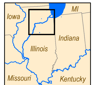
IL River Waterway Locator Map