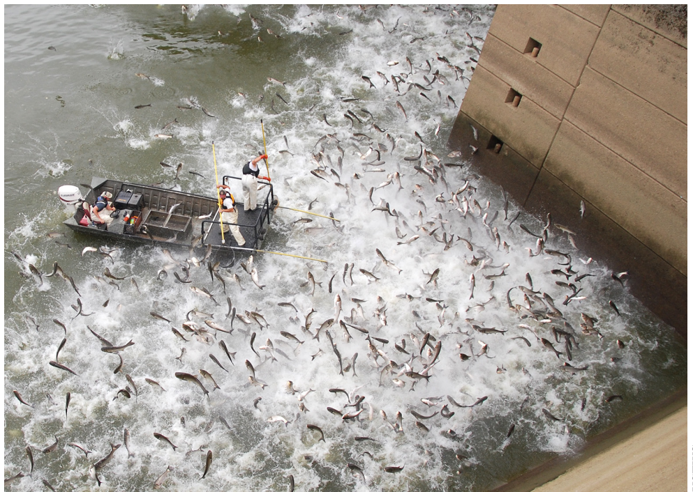
Electro-fishing silver carp at the tailwaters of Lake Barkley Lock and Dam.

Barkley lock approach offers a number of advantages. Invasive carp are present in the area and pass upstream through the lock. As a result, this project can study whether the BAFF will slow their rate of passage. Another advantage is that the only pathway for fish to get from below the dam into Lake Barkley is to pass through the lock.