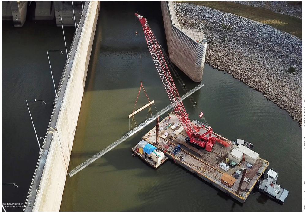
Kentucky Department of Fish and Wildlife Resources

Four species of non-native invasive carp—bighead, black, grass and silver—can be found within the waters of the United States. The surge of invasive carp threatens the country’s renowned aquatic biodiversity, outdoor economies and way of life. Federal, state, university and industry partners have joined together to test a new and innovative fish deterrent technology to slow the carps’ upstream push. A BioAcoustic Fish Fence, or BAFF, has been deployed on the downstream side of Barkley Lock in Kentucky to determine its effectiveness at reducing the movement of invasive carp through a lock chamber.